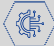
Sales & Business Development